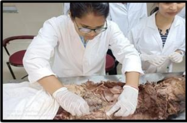
Fig.5: Student working on cadaver

Manipura Chakra is said to be located behind the navel or in the solar plexus. At the location of the navel, a secondary Chakra called Surya (sun) Chakra is located at the proper functioning of this Chakra improves dynamism, energy, will power and achievement in a person. The ten subdivisions of coeliac plexus supply to different viscera of abdomen including digestive system. Solar plexus and its function are to absorb and digest Prana from the sun. It is associated with the eyes because it is tied to the sense of sight. It is associated with the feet also because it is related to mobility.