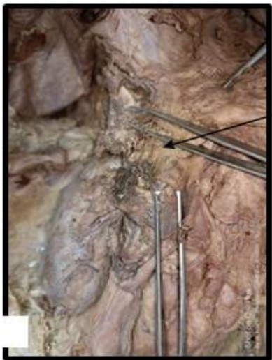
Fig. 4: Showing the renal plexus