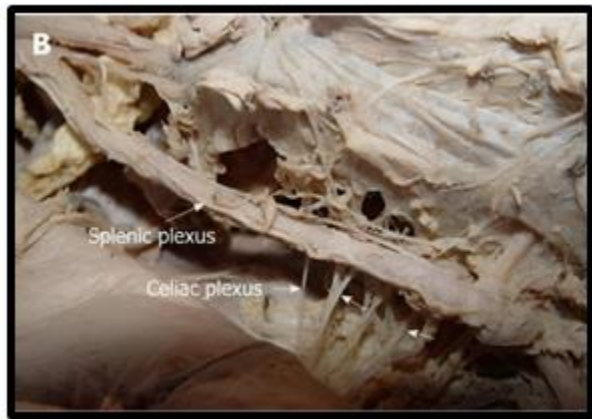
Fig. 3: Showing splenic and coeliac plexus